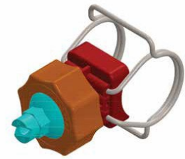
M1 Holder + nozzle + cap